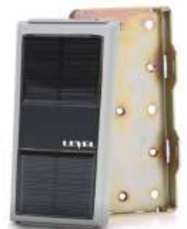
Accessories MD 092 000