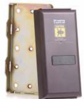
Accessories MD 092 000